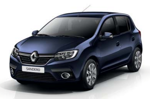
Navy Blue* (O)