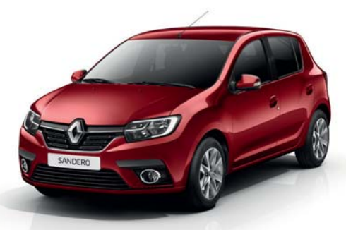
Flame Red (TE)