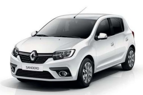
Glacier White (O)