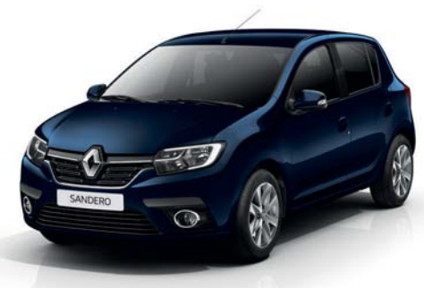
Cosmos Bleu (TE)