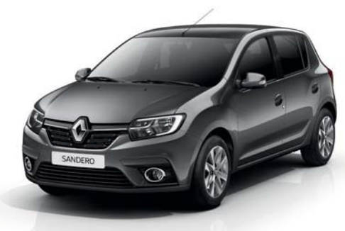
Comet Grey (TE)