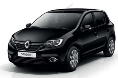
Pearl Black (TE)