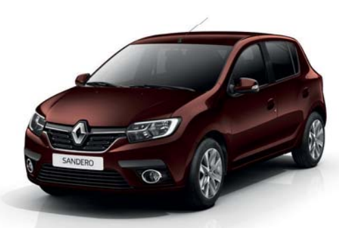
Tourmaline Brown (TE)