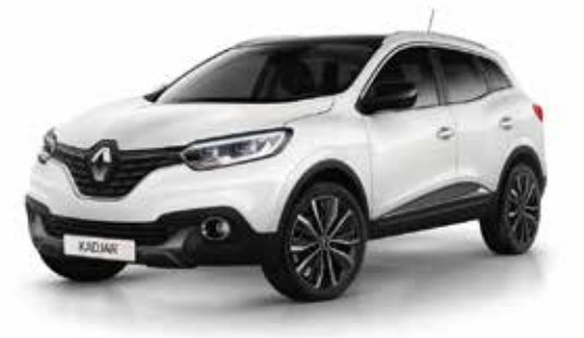
ARCTIC WHITE <sup>(3)</sup> QNC