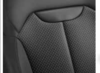
Dark Carbon fabric upholstery