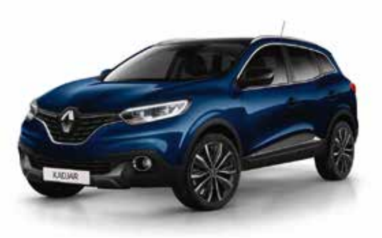
COSMOS BLUE<sup>(2)</sup> RPR