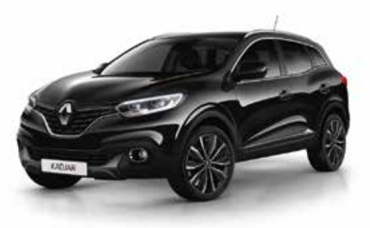
DIAMOND BLACK <sup>(2)</sup> GNE