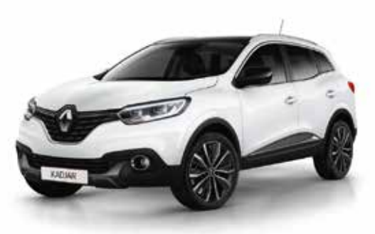
GLACIER WHITE <sup>(1)</sup> 369