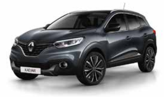
TITANIUM <sup>(2)</sup> KPN