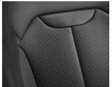
Dark Carbon fabric upholstery