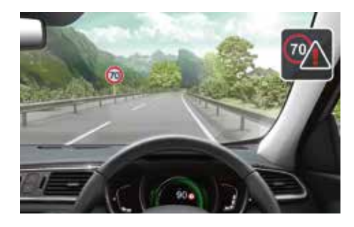
Speeding alert with traffic sign recognition

Making your motoring easier, more relaxed, safer and more fluid is one of the Renault KADJAR'S missions. Its driving assistance systems make it a breeze to adjust your speed, keep straight, check blind spots, park or automatically switch to dipped or full beams depending on whether other vehicles are in the vicinity. With KADJAR, driving is as safe as can be.