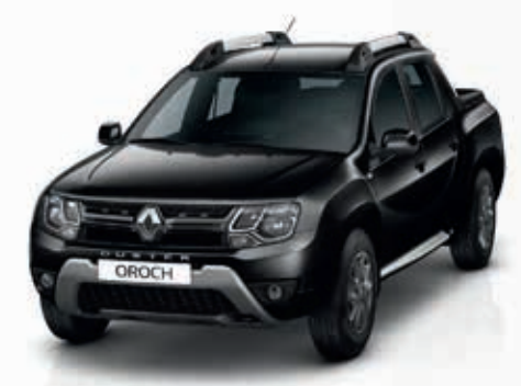
Pearl Black (MP)