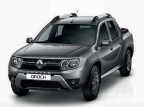
Steel Grey (MP)