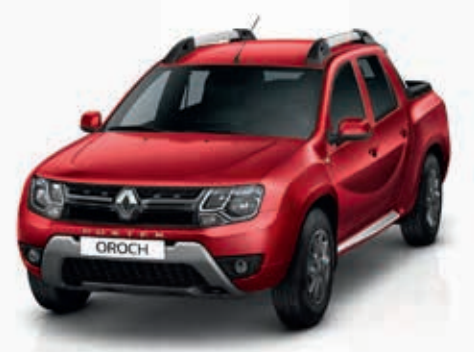
Flame Red (MP)