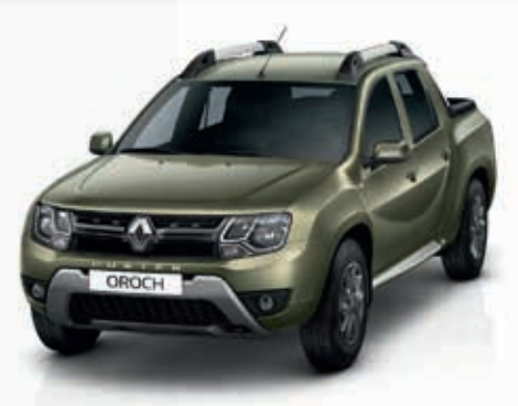
Emerald Green (MP)