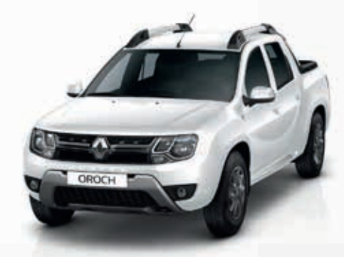
Glacier White (OC)