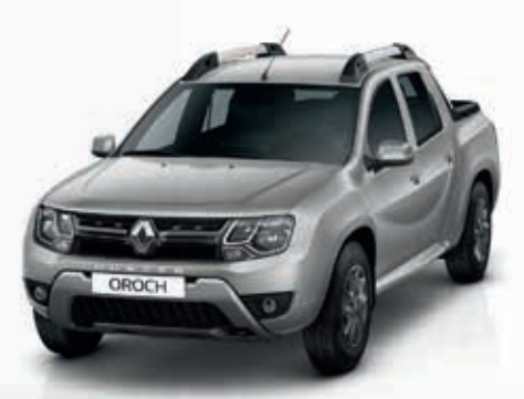
Star Grey (MP)