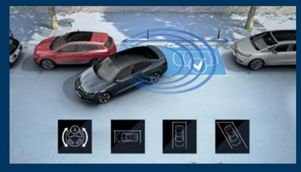
Easy Park Assist. Park with no problem: the system measures the available space and defines the trajectory on its own. Trust it with the steering and admire the manoeuvring.