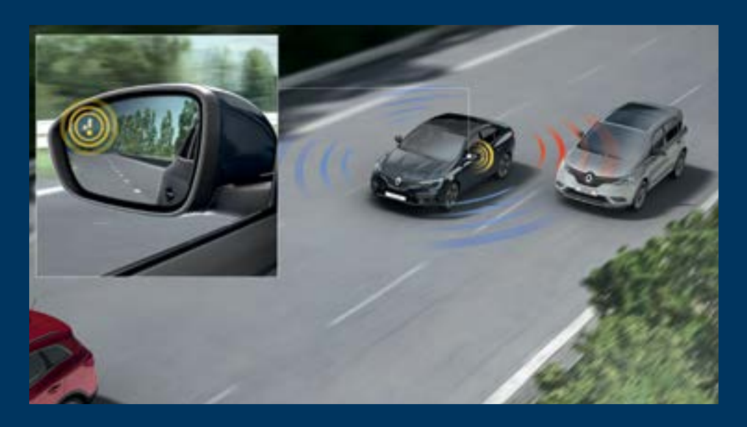
Blind Spot Warning & Moving Object Detection. Be warned against potential collisions with other vehicles to the side and/or to the rear during lane changes between 30 and 140 km/h.

A new era of modernity, comfort and safety awaits, thanks to the driver assistance technologies that Renault has installed in New Renault MEGANE. It analyses every situation and instantly activates the appropriate technological solution to protect, warn, or assist its driver.