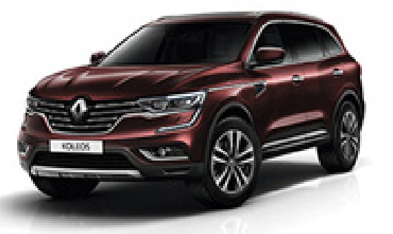
Mineral Beige Marron Red